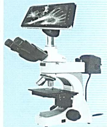
MELUX-NTV-44 Upright Metallurgical Microscope With Built In Computer & Auto Camera