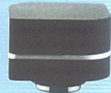
MEDICOM-44 DIGITAL CAMERA