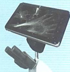
MICROPAD-777 Digital Camera System (For all Brands/ Models with built-in Touch Screen, computer and Measurement Software)