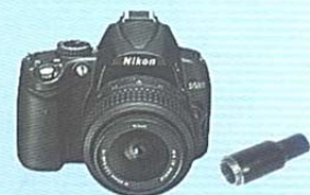
MD-55 Automatic Video Cum Photo Micrography Equipment