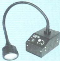
EP-3A UNIVERSAL HALOGEN ILLUMINATOR with variable light control