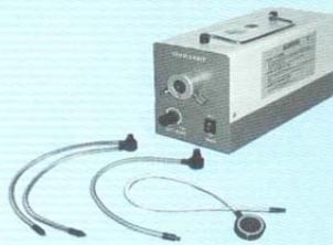
OPTOLITE 150 FIBRE OPTIC ILLUMINATOR WITH FLEXIBLE LIGHT GUIDE AND POWER SUPPLY