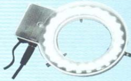
OP-12R High Intensity Fluorescence LED illumination (Front & Back view)