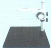
GM-1 GIPPON-JAPAN Long Arm Stand