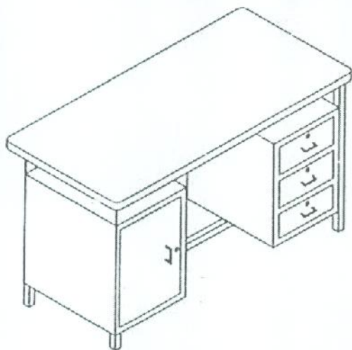
SS OFFICE TABLE